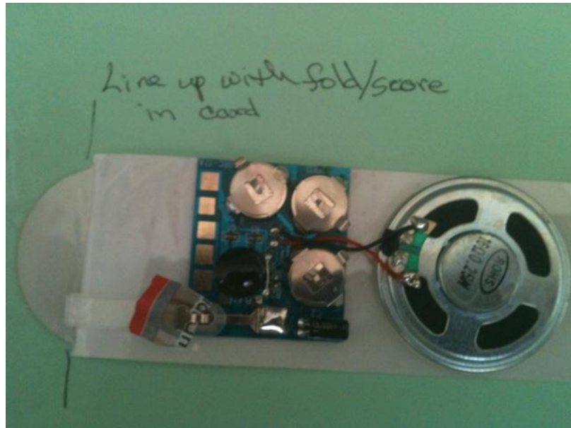
10 Second Slide Tongue Module

Step 4: Place the module on the fold as indicated below: